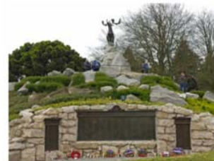
Beaumont Hamel Memorial