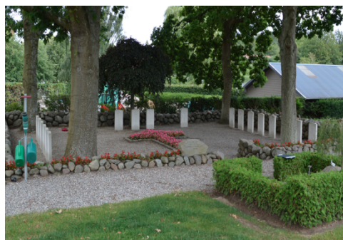
Assens (Fyn) New Cemetery