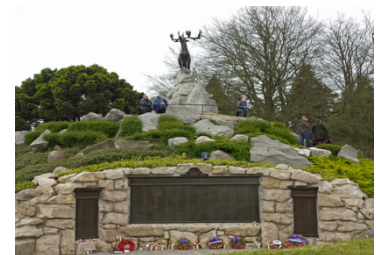
Beaumont Hamel Memorial