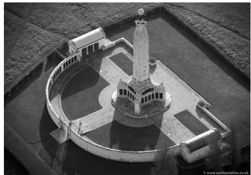
Chatham Naval Memorial