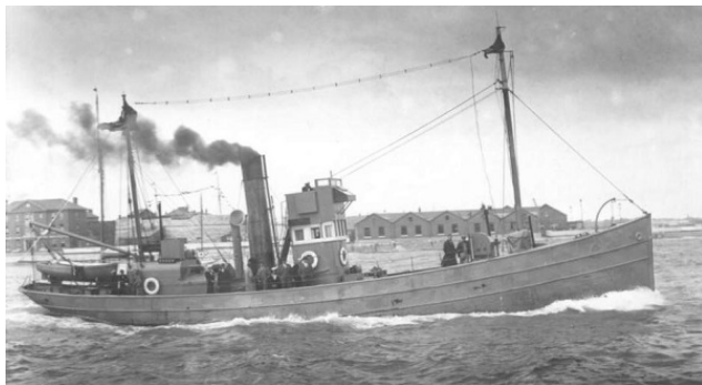
HMD City of Liverpool