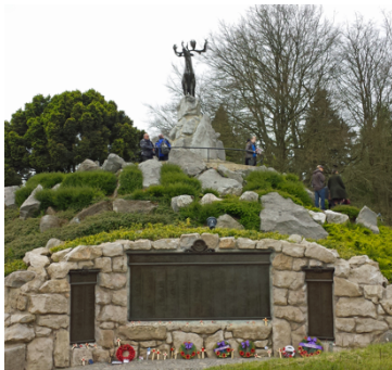
Beaumont Hamel Memorial