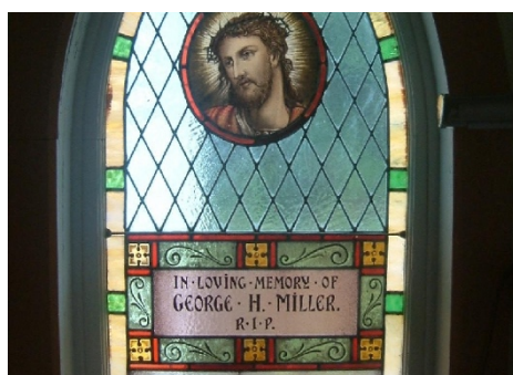
Memorial Window, St. Matthew's Church, Trouty