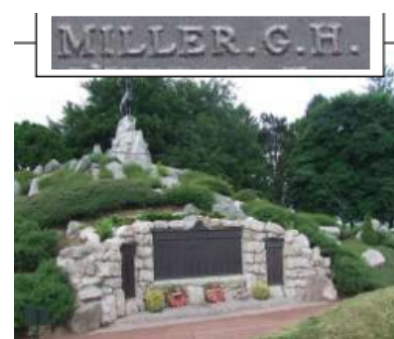
Beaumont Hamel Memorial