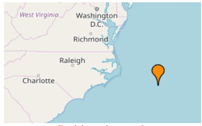
Position when sunk

was hit on the starboard side underneath the aft mast by one G7e torpedo from <u>U-107</u> while steaming on a non-evasive course in good weather about 130 miles east-southeast of Cape Hatteras, off the North Carolina coast. The U-boat had spotted another freighter but disengaged to chase the SS Major Wheeler which after being hit immediately developed a list to starboard and sank by the stern in two minutes. All eight officers and 27 crewmen perished.