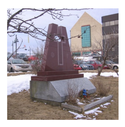
K of C Fire Memorial