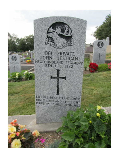
Mt. Pleasant Cemetery

Shortly after 11 pm a devastating fire erupted consuming the building in minutes. Eighty servicemen and 19 civilians died, and 109 others were severely injured. The cause of the fire was never definitely determined but arson was suspected and possibly, sabotage. John and the other 21 members of the Royal Newfoundland Regiment who were among the casualties were interred with full military honours at Mount Pleasant Cemetery, St. John's