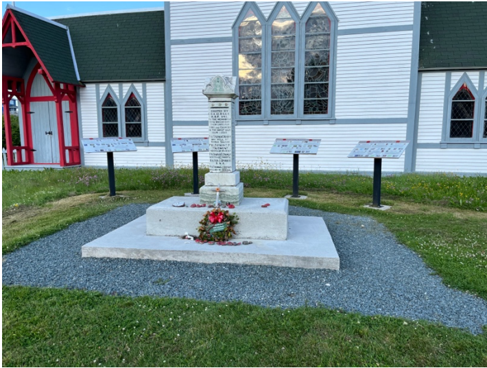
War Monument with Storyboards