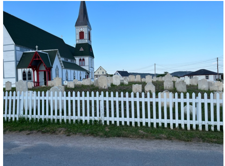
St. Paul's Churchyard Post Restoration