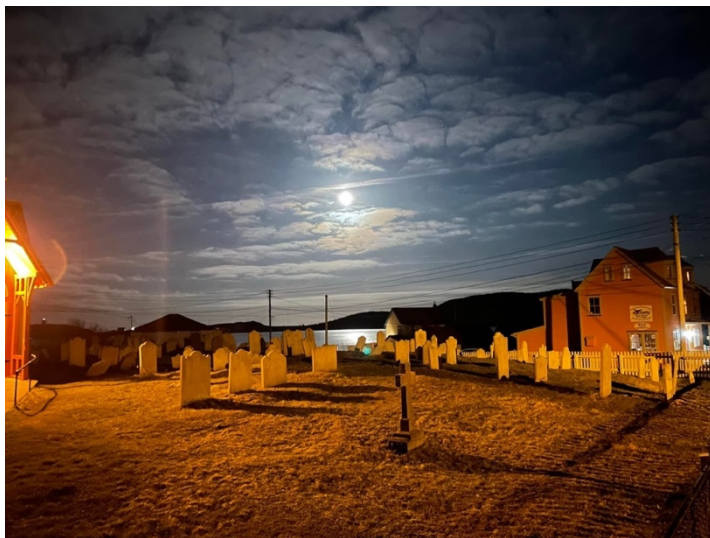
St. Paul's Churchyard Post Restoration Photo